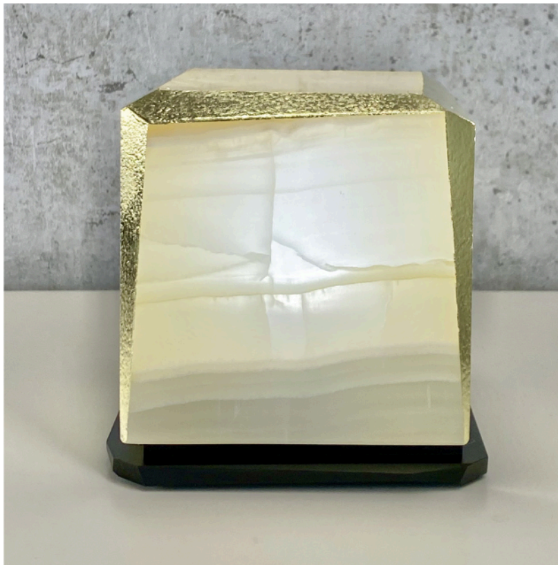
ITSU Two, faceted onyx cube covered with gold leaf (personalized, custom-made)